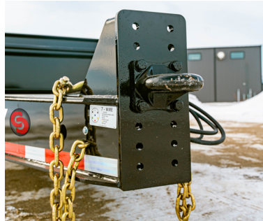
Adjustable pintle eye