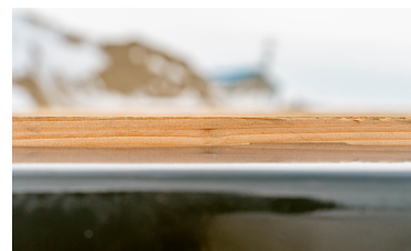
Deck boards sit above outside end frame rails