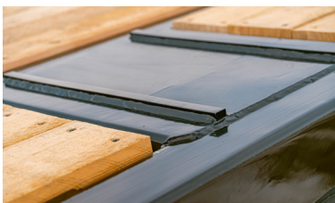
Heavy duty grosser bars on wheel covers for improved traction