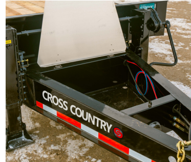
Lockable tool box