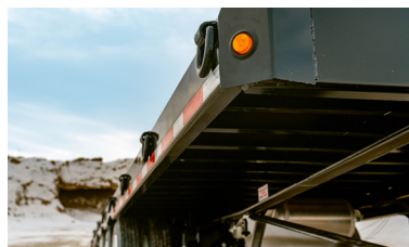
Formed 8" side rail constructed from 100,000 psi hi-tensile steel