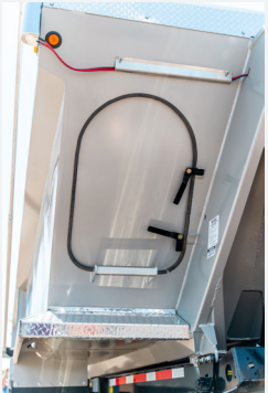
Front Access Door