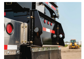
Low profile bolt-on push block