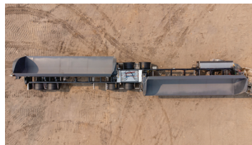
Tipped in opposite directions