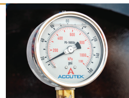
4" load scale gauge