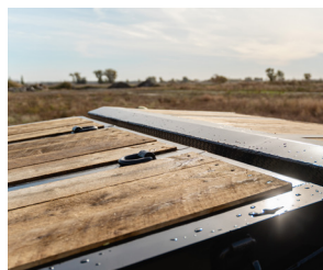
Upper deck access