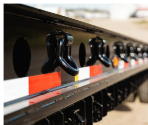
D-rings on siderails