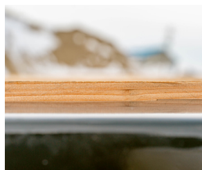
Deck boards sit above outside end frame rails