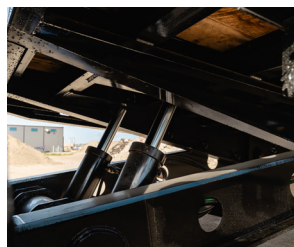
Hydraulic lift cylinders