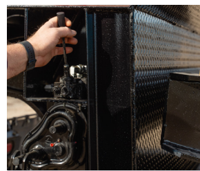
Deck lift control located at landing gear