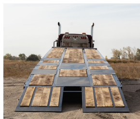
10-degree load angle